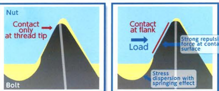
«Before closing» Thread elastic deformation «After closing»

※The whole thread of the screw exhibits a strong springing force, with the force working to return to the bearing surface.